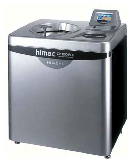
CP-WX series preparative ultracentrifuge