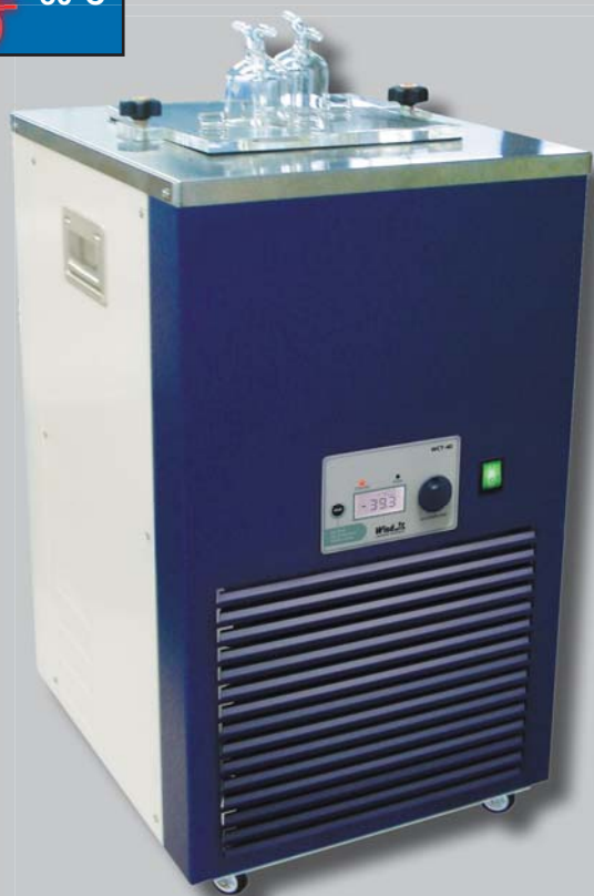
WCT-40 with 2x glass cold trap (included)