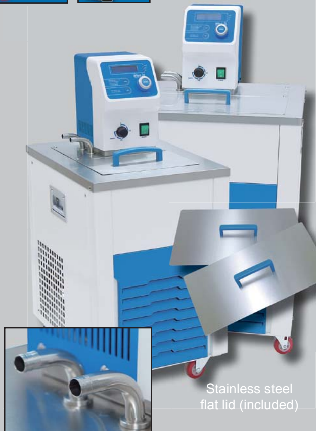
Stainless steel flat lid (included)

Connection for external circulation Ø12.5mm