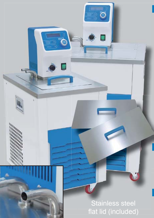
Stainless steel flat lid (included)