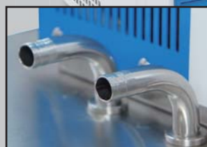
Connection for external circulation Ø12.5mm