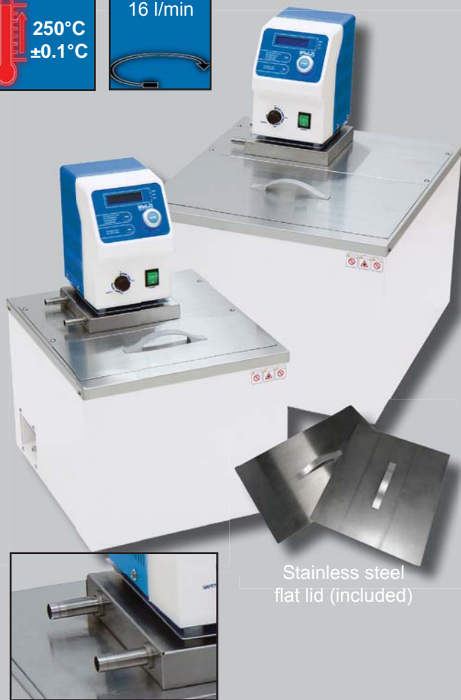
Stainless steel flat lid (included)