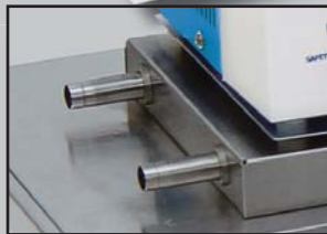
Connection for external circulation Ø12.5mm