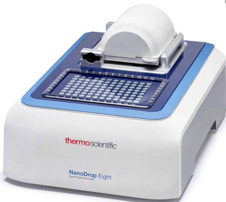
NanoDrop Eight 8-channel Microvolume UV-Vis Spectrophotometer

The NanoDrop Eight Spectrophotometer accurately measures a wide concentration range of nucleic acid samples using a 1 to 2 \mu\text{L} sample size. The auto-ranging pathlength technology on the NanoDrop Eight instrument pedestals allows life scientists to measure samples in an expanded concentration range, eliminating the need for error-prone dilutions. The 8-channel pedestal system on the NanoDrop Eight Spectrophotometer allows for simple implementation in high throughput workflows and includes a quick measurement time of about 15 seconds. The accuracy was evaluated by comparing several dsDNA dilutions measured on the NanoDrop Eight Spectrophotometer with the NanoDrop 8000 Spectrophotometer as a reference. Reproducibility for each dilution was calculated from concentration measured on the NanoDrop Eight instrument.