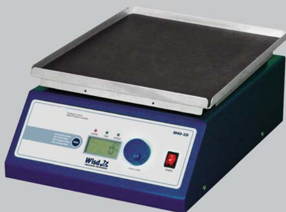
SHO-1D with optional rubber mat platform