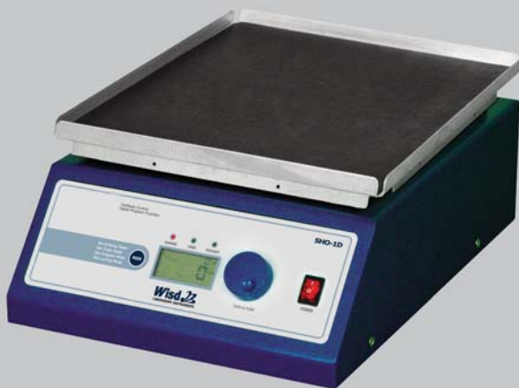
SHR-1D with optional rubber mat platform