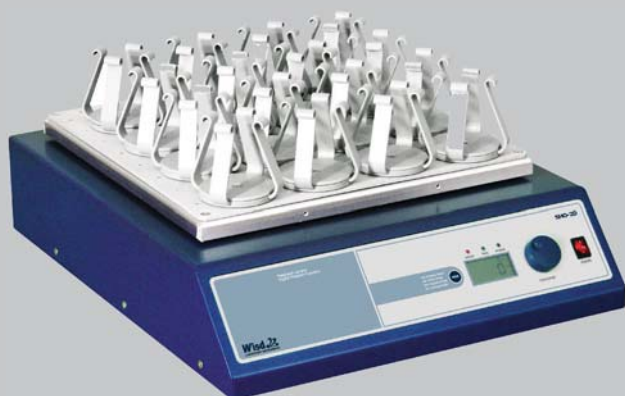
SHO-2D with optional universal platform and flask holder