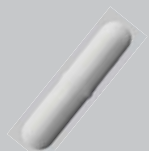
Stirrer bar included