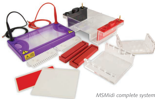
MSMidi complete system