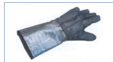
(2) Heat-resistant Gloves