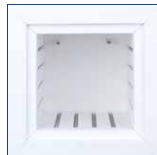
Inner Chamber of Exposed Heating Elements-type