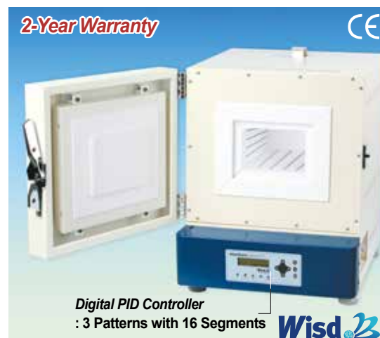
1200°C Digital Muffle Furnace, Embedded Heating Elements-type "FHP-14"

DH.WFH312.P63 , "FHPV1263", for "FHP-63"