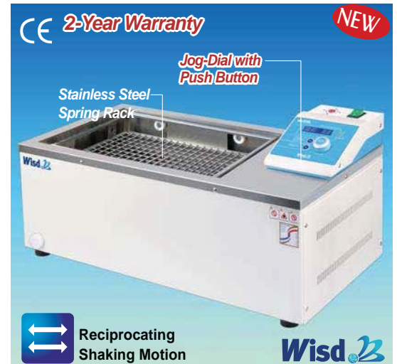
Digital Precise Shaking Water Bath "WSB-18" with Universal Spring Rack