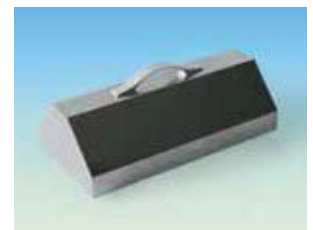
(2) Dome Lid, Stainless Steel (Optional)