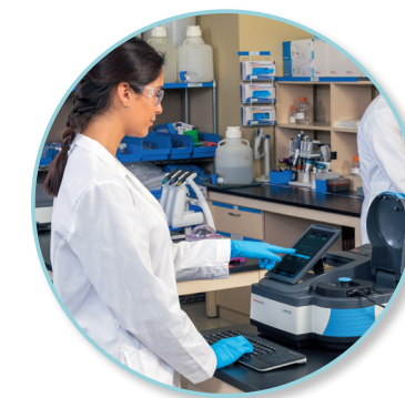
Thermo Scientific™ BioMate™ 160 UV-Vis Spectrophotometer