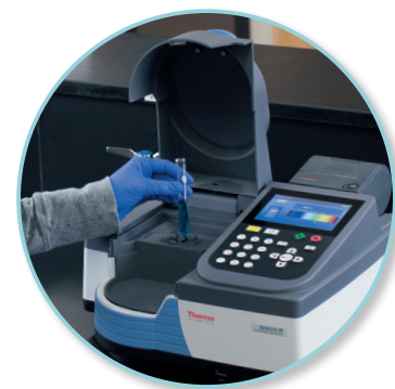
GENESYS 30 Visible Spectrophotometer

For teaching labs, research labs and industrial QC requiring robust construction, ease-of-use and software capability.