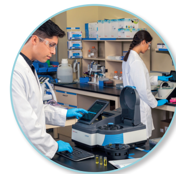
GENESYS 140 Vis/150 UV-Vis Spectrophotometers

For advanced teaching labs, R&D, research and life science applications requiring higher throughput or temperature control.