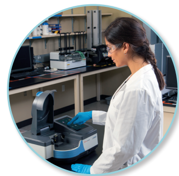
GENESYS 40 Vis/50 UV-Vis Spectrophotometers