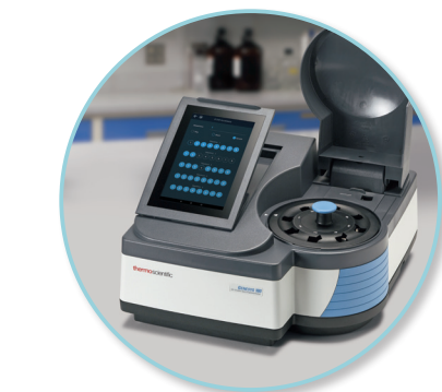
GENESYS 180 UV-Vis Spectrophotometer