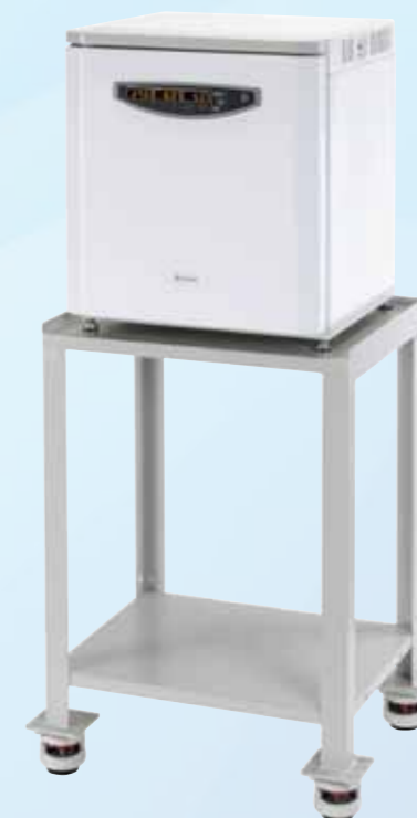
Space saving cart is available for both 30L and 50L AP30STD / AP50STD