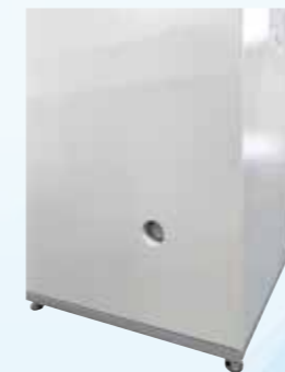
Access port is standard on the Penguin 50L and optional for 30L