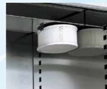
Air Filter IF-30 or IF-50 Air Filter (Half thickness) IF-30T or IF-50T