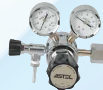
Gas Regulator IM-055