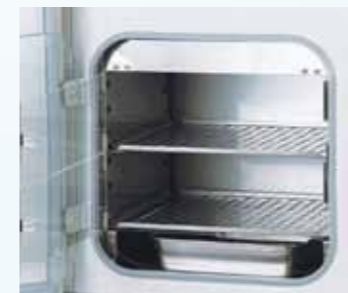
Inner Acrylic Doors (AP-100-2)

Inner Glass Doors (GAW-30AGS or GAW-50AQS) for extra security and limited access windows for preserving the gas levels and temperature inside.