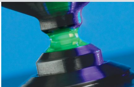
NanoDrop 3300 patented retention system

As the industry leader in micro-sample quantitation, Thermo Scientific NanoDrop products meet the needs of today's laboratory scientist with instruments that are smart, simple and robust. We combine our extensive expertise in micro-sample analysis with an in-depth understanding of real-life applications to deliver the latest in UV-Vis and Fluorescence instrumentation.